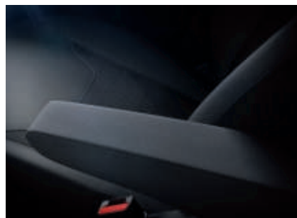
Driver's seat adjustable lumbar support and armrest (Standard)