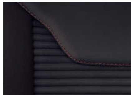
Partial leather/embossed cloth trim (Standard)

Model shown is a Transit Courier Van Sport in Race Red solid body colour (standard).