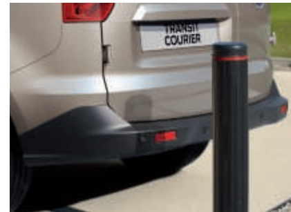
Rear parking distance sensors (Standard)

Model shown is a Transit Courier Van Limited in Diffused Silver metallic body colour (option).