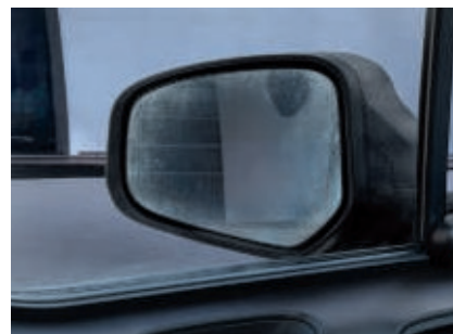
Electrically-operated and heated door mirrors (Standard)

Model shown is a Transit Courier Van Trend in Metal Blue special metallic body colour (option).