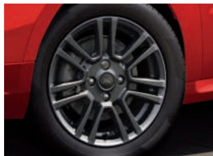
16" 7-spoke alloy wheels with 'Magnetic' painted finish (Standard)