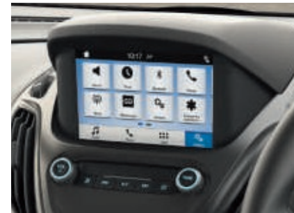
Ford SYNC 3 with 6" touchscreen (Standard)